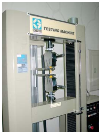
Professional Lab Test Equipment